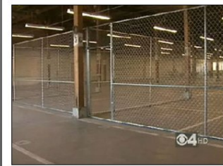
Inside are dozens of metal cages. They are made out of chain link fence material and topped by rolls of barbed wire.