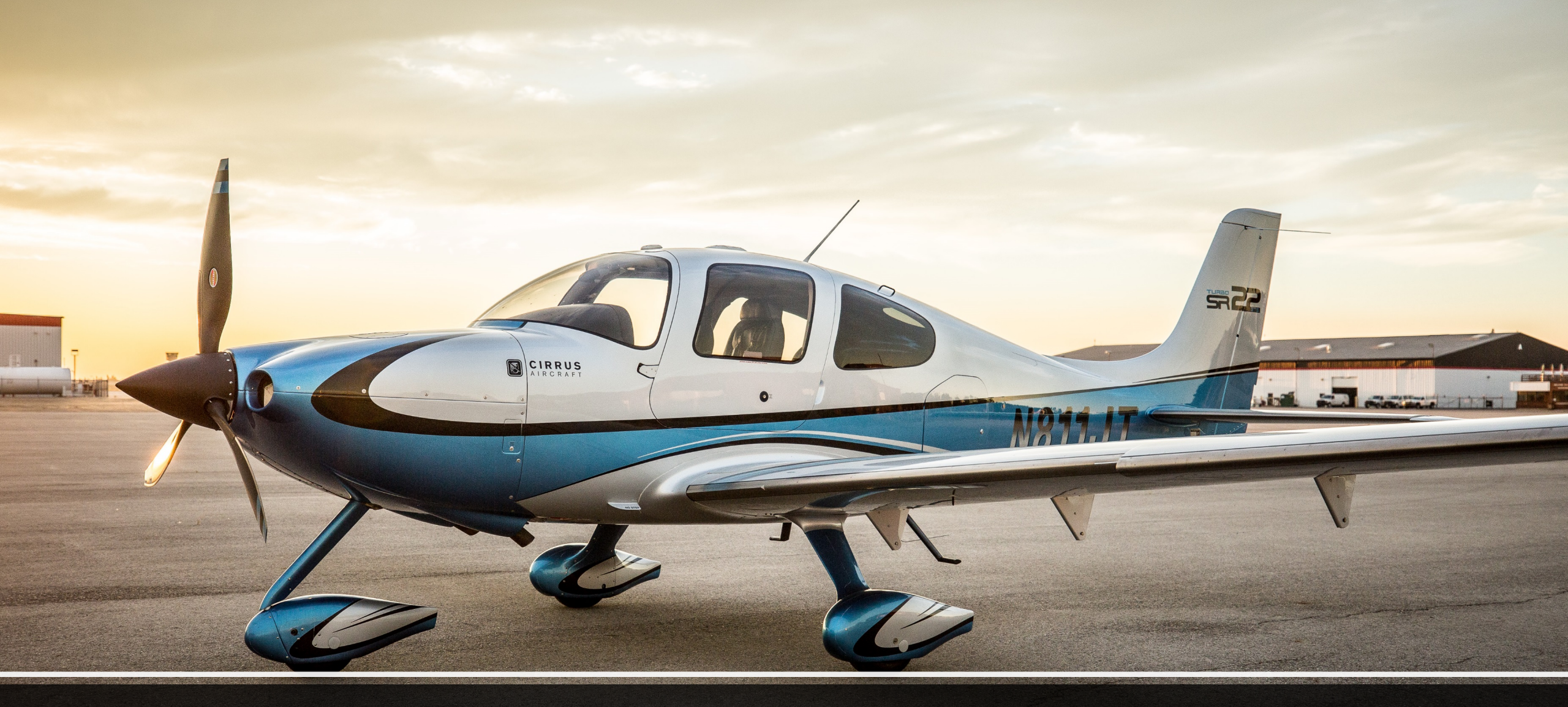
The Use of General Aviation for Disaster Mitigation